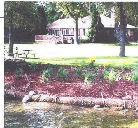
A well-planned landscape with natural vegetation erosion, preserve the views and allow access to t

Much can be done to enhance the natural characteristics of areas that are currently maintained as mowed lawns. However, areas of full sun